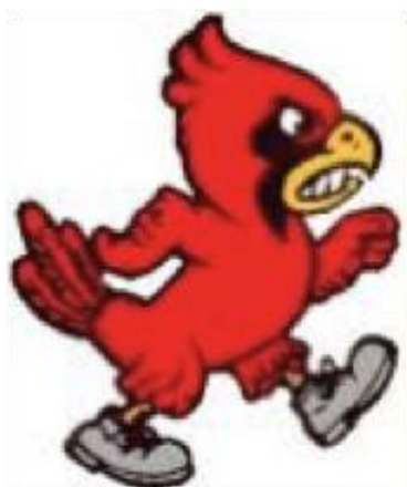
Sun Prairie Band Boosters